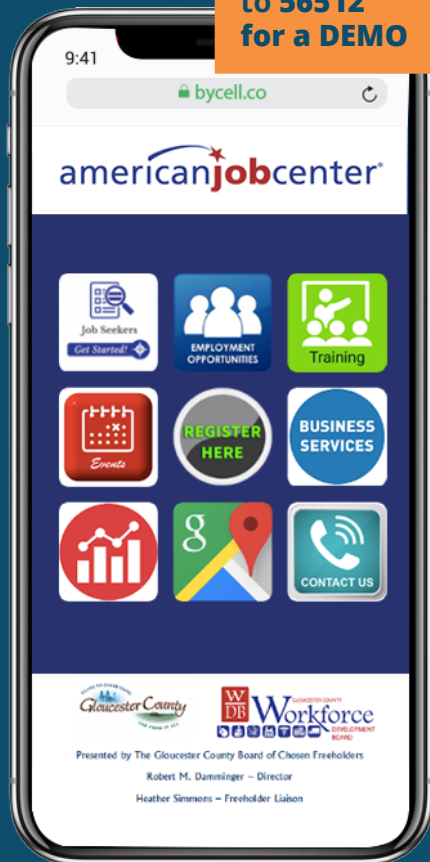
SAMPLE MOBILE RESOURCE GUIDE